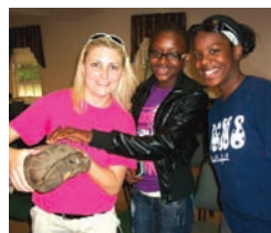
Discover: During the Reptiles ALIVE! Class, students and teachers have the opportunity to "touch" reptiles