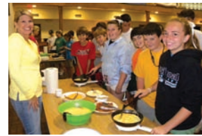
Learning Lifetime Skills: Make Your Own Omelet Breakfast! Also, leaders and students learn the importance food safety and why eggs are "eggcellent" for them.