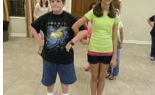
Learn by Doing: "Slide-Slide-Slide!" Students take cues from the caller during the Folk Dance.