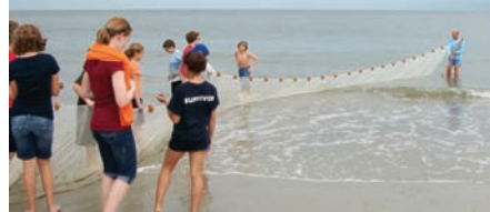
Down-By-Sea: Teachers and students enjoy the seining and beach ecology class at Tybee Island.