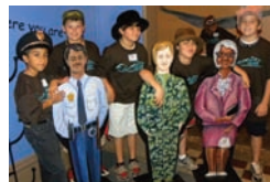
"Hands-On" Experience: Exploring and learning about Historic Savannah – 1733.