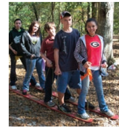
Team Building: The Challenge Course is designed to build confidence to succeed and teach the principles that you will learn in order to help you to lead in the future.