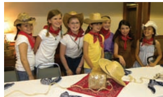
Personal Development: Table manners and etiquette are learned during the theme banquets. Teachers and students enjoy wearing costumes to match the banquet theme, such as "The Wild West".