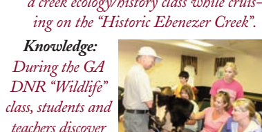
Knowledge: During the GA DNR "Wildlife" class, students and teachers discover many of GA's fur bearing animals.