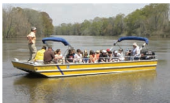
Adventure in "The Puddle Shuttle": Students learn to appreciate life during a creek ecology/history class while cruising on the "Historic Ebenezer Creek".