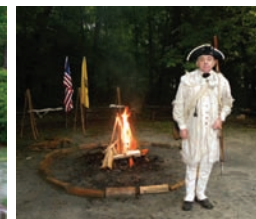
Revolutionary Living History: During a camp-fire, students and leaders learn and develop an appreciation for Revolutionary soldier's life.