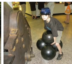
Adventure! Having a "blast" at an old fort.